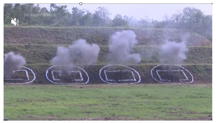
November 8, 2024: Taiwan: Military's 1<sup>st</sup> live-fire drills, with anti-tank rockets, developed in Taiwan.

November 7, 2024: Taipei, Taiwan: Taiwan's Army held what it said was its first livefire drills of locally made anti-tank Kestrel rockets on Wednesday, November 6, 2024. Citizens enrolled in Taiwan's recently implemented one-year conscript program and fired the rockets in a drill at a shooting range in Tainan.