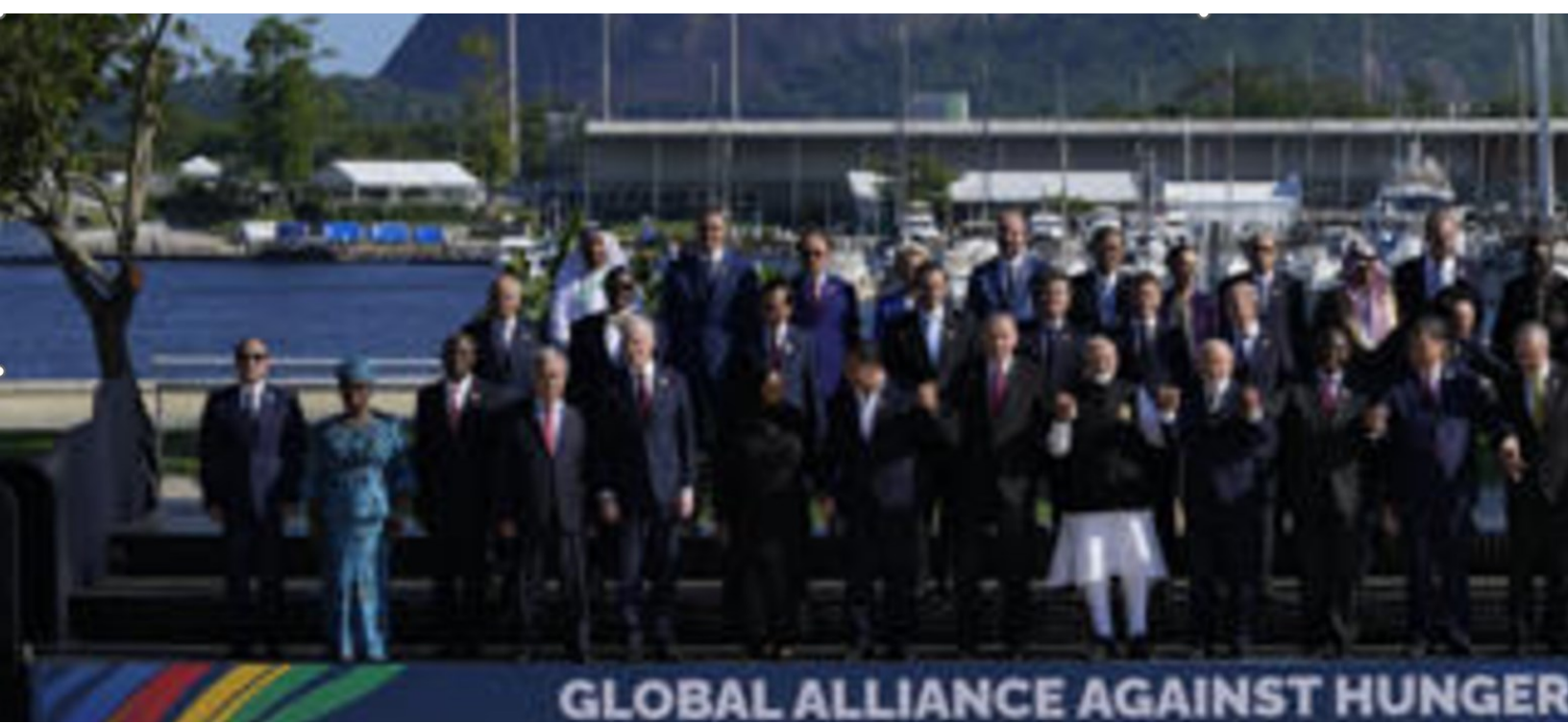
November 18, 2024: Rio de Janero, Brazil: G20 Summit. President Joe Biden is in the 3<sup>rd</sup> row.

---- A BACKGROUNDER on MILITARY EXERCISES by CHINA around TAIWAN ----November 8, 2024: Taipei, Taiwan : Within 48 hours of the declaration of victory by the 45<sup>th</sup> President Donald John Trump at <u>the presidential general election of</u> <u>November 5, 2024</u>, China conducted military exercises around Taiwan, which have raised tensions in the region. These exercises are seen as a show of force by China. The Communist Part of China has been particularly against the assumption of power by Lai Ching-te , the President of Taiwan, whose party won a 3<sup>rd</sup> consecutive term. President Lai Ching-te belongs to Democratic Progressive Party, which wants an independent democratic country in the Island.