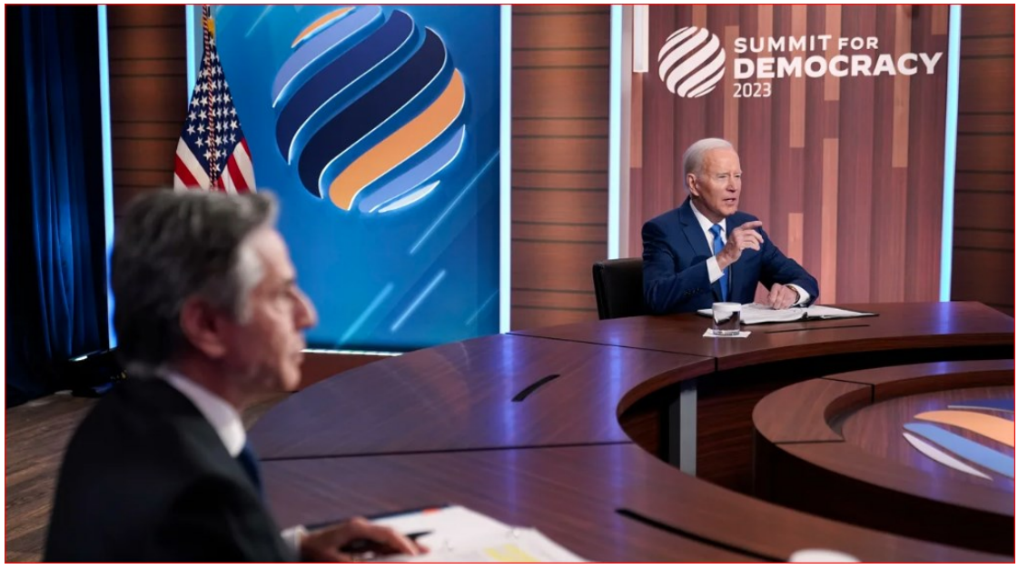
March 29, 2023: 2<sup>nd</sup> Summit for Democracy (virtual)

These developments highlight the ongoing tensions between China and Taiwan, and the situation remains closely monitored by the international community.