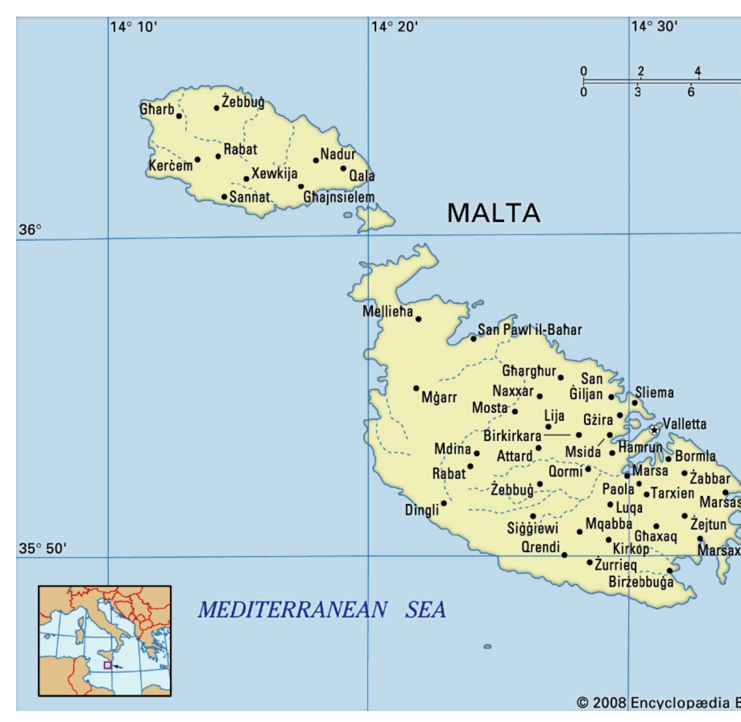
MAP.3. The Republic of Malta; The capital Valletta is in the South-Eastern part of the bigger island.

---- A Brief Note on the new POLITICAL PARTY of GERMANY – BSW -----(Reference: <u>https://en.wikipedia.org/wiki/Sahra Wagenknecht Alliance</u>)