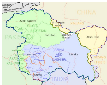
The MAP.4. J&K with the current Line of Control defined in 1972 (similar to that of 1949)

Another anomaly arose at the Southern end of the ceasefire line in Jammu. From the terminus of the ceasefire line to the international boundary between Indian and Pakistani Punjab, there was a gap of over 200 Km, which was covered by a recognised "provincial boundary" between Pakistani Punjab and the Indian State of J&K. India generally referred to this boundary as the "international border", whereas Pakistan referred to it as the "border" or the "working border".