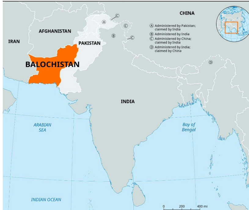
The MAP.2. location of Balochistan in the Indian Sub-continent Population (Estimate 2023): 15 Mn; Area: 347,190 Km 2 ; Density: 43/ Km 2 ; GDP (Estimate 2023): $20 Bn; GDP/capita: $1,621. (References: https://www.britannica.com/place/Balochistan , https://en.wikipedia.org/wiki/Balochistan, Pakistan )

In June 2022, the Karot Hydropower started commercial operations to provide cheap and clean electricity and aims to reduce 3.5 million metric tons of carbon emissions annually.