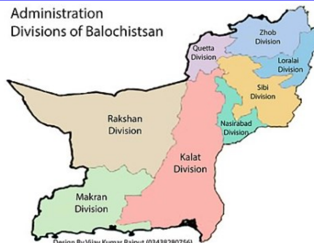
The MAP.6.: The Eight Divisions of Balochistan

(Reference: https://en.wikipedia.org/wiki/Balochistan, Pakistan )