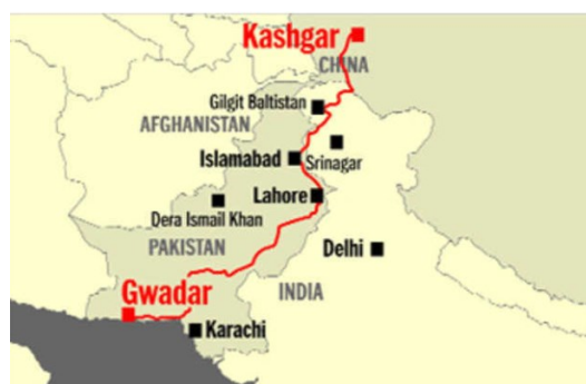
The MAP.1.: CPEC joins Kashgar , in China , with Gwadar port on the Indian Ocean .

In Pakistan, CPEC aims to overcome an electricity shortfall, to develop the infrastructure and to modernize transportation networks. CPEC would help Pakistan shift from an agricultural economy to an industrial economy by establishing new industries in the CPEC Special Economic Zones. CPEC's potential impact on Pakistan has been compared to that of the Marshall Plan, undertaken by the United States in post-war Europe . Pakistani officials predict that CPEC will result in the creation of upwards of 2.3 million jobs between 2015 and 2030, and add 2 to 2.5 %age points to Pakistan's annual economic growth. As of 2022, it is supposed to have enhanced Pakistan's exports. CPEC has provided 1/4th of its total electricity production.