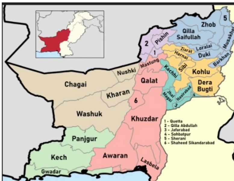
The MAP.8.: Baloch Liberation Army -2021 is more active in the 6 places, shown in the map.

BLA has another active center in Turbat in Kech District.