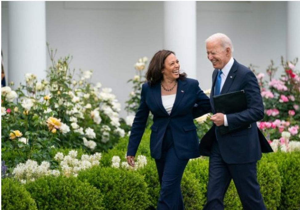
White House, Washington D.C. USA:

On X, Biden endorsed Vice President Kamala Harris as the Democratic candidate, and asked the people to donate to her campaign. The letter, released by the White House, was copied as an earlier X message.