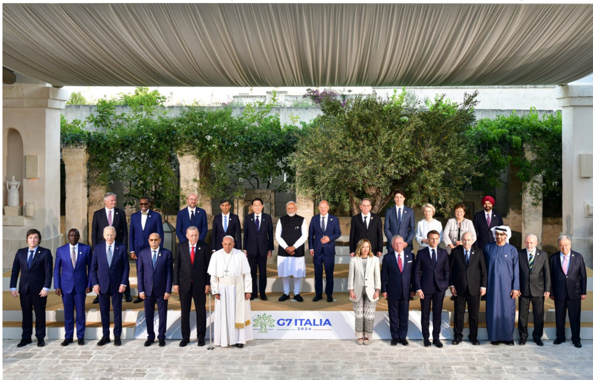
June 14, 2024: Borgo Egnazia (Fasano) in Apulia, Italy: G7 Leaders & Invitees

June 14, 2024: Rome, Italy: Giorgia Meloni , the Prime Minister of Italy, introduced Narendra Modi as the most popular democratic Leader of the world . Modi had gone to the meeting, after taking oath as the Prime Minister of India for a 3 rd consecutive term , on 9 th June 2024 , after the General Elections, in which 642 Mn citizens, out of 969 Mn registered voters had exercised their franchise for electing 543 members of the Lok Sabha (the Lower House of India's Parliament).