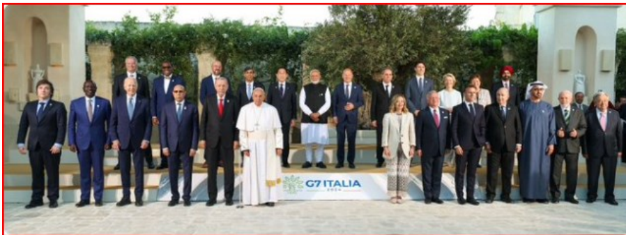
June 14, 2024: World Leaders at the G7 Summit in Italy