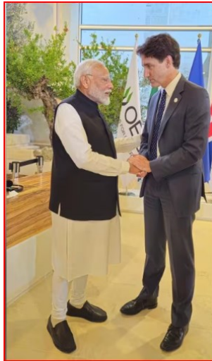
June 14, 2024: the sidelines of the G7 Summit in Apulia, Italy Canadian and Indian Prime Ministers - Trudeau and Modi - meet

June 14, 2024: the sidelines of the G7 Summit in Apulia, Italy : Canadian and Indian Prime Ministers - Trudeau and Modi – met in Italy and were able to eliminate the tensions, which had affected the relations between the two members of the British Commonwealth since September 18, 2023 , when Prime Minister Justin Trudeau addressed the Canadian Parliament and stated that Canadian security agencies had obtained “credible allegations” linking “agents of the Indian government” to the killing of Canadian Sikh Hardeep Singh Nijjar . India’s Ministry of External Affairs rejected Trudeau ’s allegations, calling them “absurd” and emphasizing the focus on Khalistani terrorists and extremists sheltered in Canada.