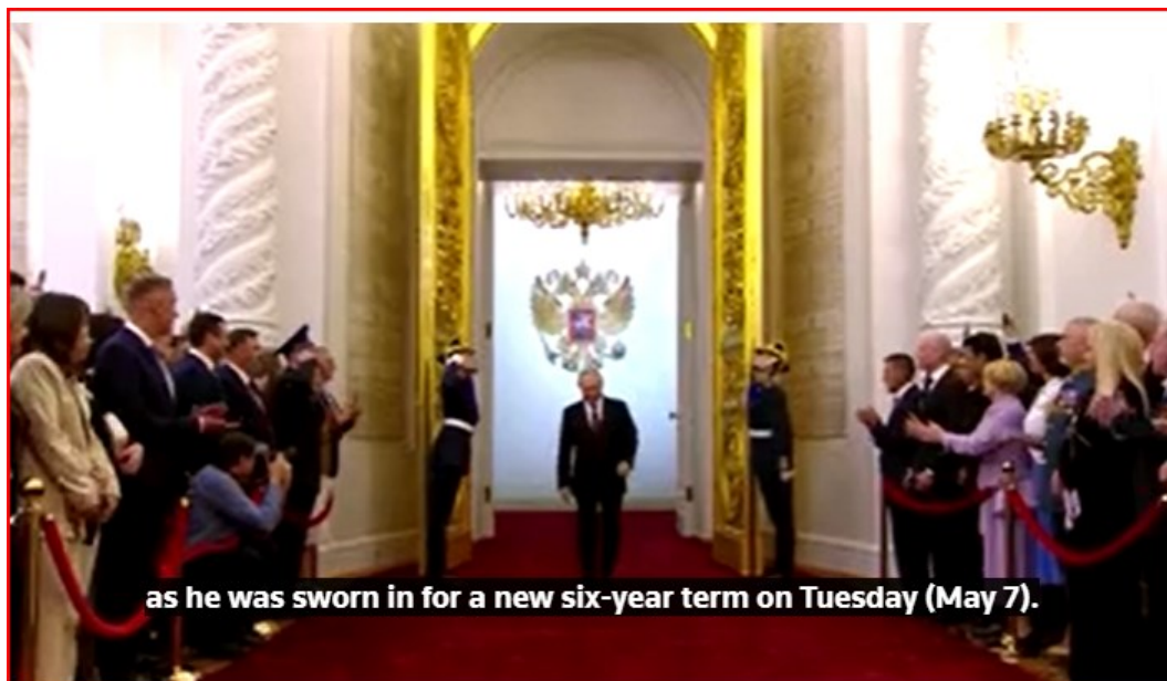
as he was sworn in for a new six-year term on Tuesday (May 7).

May 7, 2024: Moscow: Russian President Vladimir Putin , 71, in his inauguration speech, said that his landslide re-election in March was proof the country was united and on the right track.