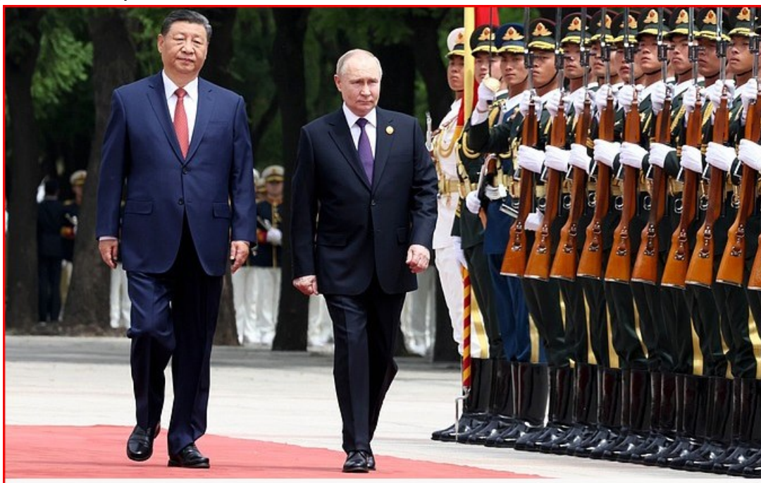
May 14, 2024: Beijing, China: President Putin on a State Visit to China

May 14-15: Beijing, China: State visit of President Vladimir Putin to China: The State Visit is immediately after President began his 3 rd term as President at a ceremony in Kremlin on May 7, 2024 and after the visit of President Xi Jinping to Europe from May 6-10, 2023.