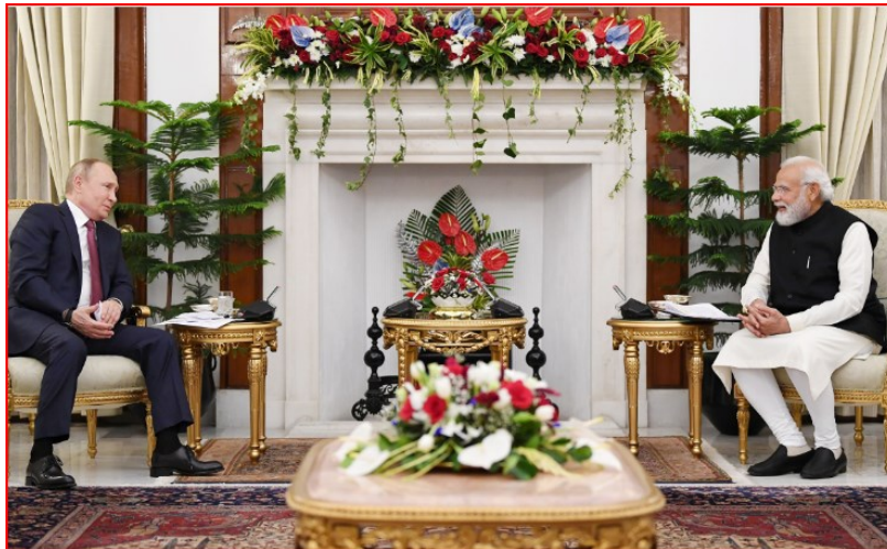
December 6, 2023: Delhi, India: 21st India – Russia Annual summit Vladimir Putin, the Russian President with Narendra Modi, the Indian PM

Not only this, but the Russian President also talked at length about the India-Middle East-Europe Economic Corridor (IMEC) . He said that USA has jumped into the "last car" of the project, proposed by the European Union, Saudi Arabia and India. President Putin said that IMEC was designed to help Russia.