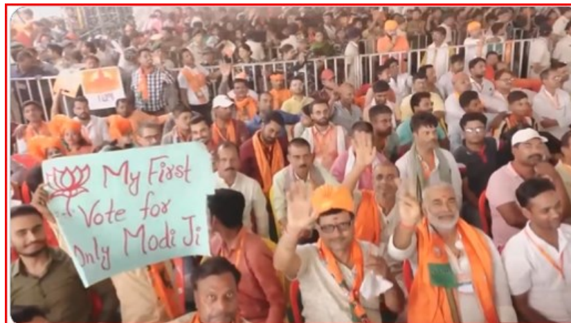
Crowds at a recent Poll Rally of Narendra Modi

Prime Minister Modi's response : " Making India a developed country by 2047 ": Prime Minister accused the Congress party of being a 'mureed' (meaning "the follower") of Pakistan, claiming that the neighboring country was eager to see the Congress leader, whom he referred to as 'shehzada' (meaning "the Prince"), become the next prime minister of India.