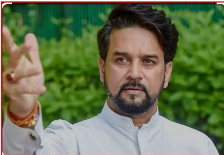
Anurag Thakur, India's Information and Broadcasting Minister

Title #2: China's Attempt to influence Elections through Leftist Media; "NewsClick: Arrests, Allegations, and Press Freedom"