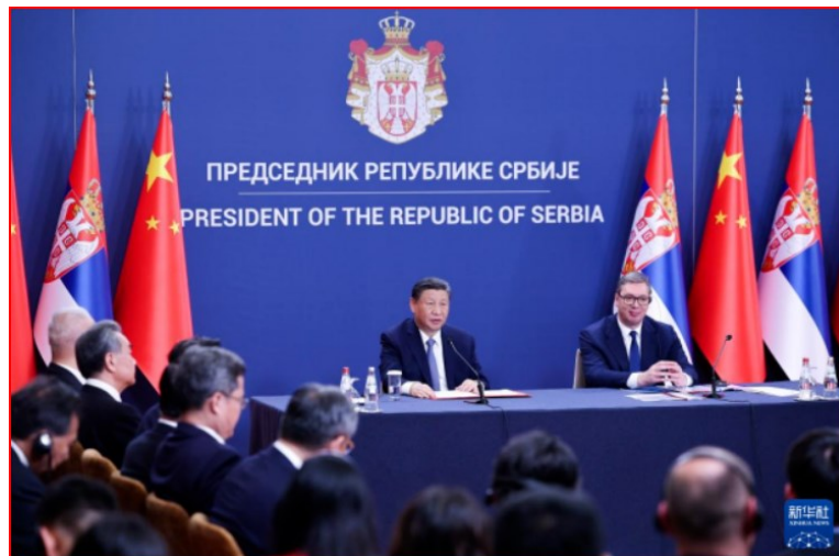
May 8, 2024: China's President Xi Jinping and President Aleksandar Vučić of Serbia at a Press Conference after their talks at the Palace of Serbia , Belgrade

May 7, 2024: Belgrade, Serbia: Late in the evening, President Aleksandar Vučić and his wife, the Prime Minister, former President, Speaker of the Parliament, Foreign Minister and others welcomed President Xi Jinping and his wife at the airport. Special Serbian performances were arranged at the airport to make the reception memorable.