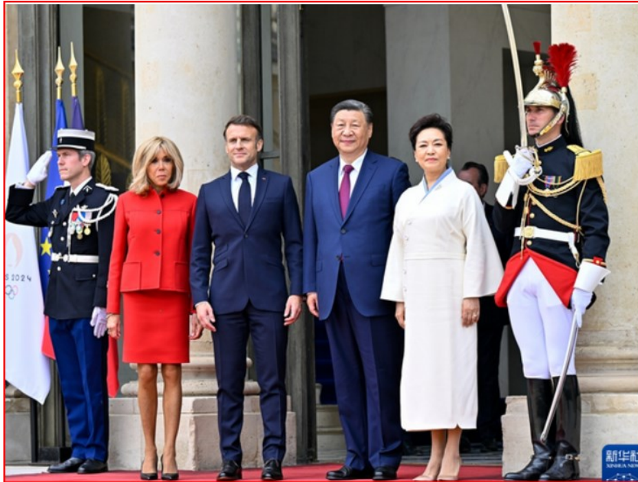
May 6, 2024: Elysées Palace, Paris France: Presidents Macron and Xi Jinping

President Macron has indicated that he wants a European policy to help Ukraine, different from that of USA. He has also shown his readiness to send French troops to help Ukraine.