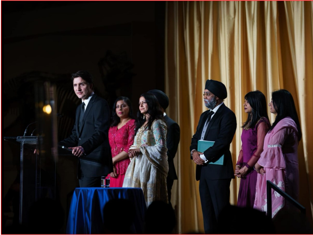
May 5, 2024: Toronto, Canada: Prime Minister Justin Trudeau at Celebration of the festival of Baisakhi

established close relations with the fellow Commonwealth country of India, which is the most vibrant and the largest democracy of the world.