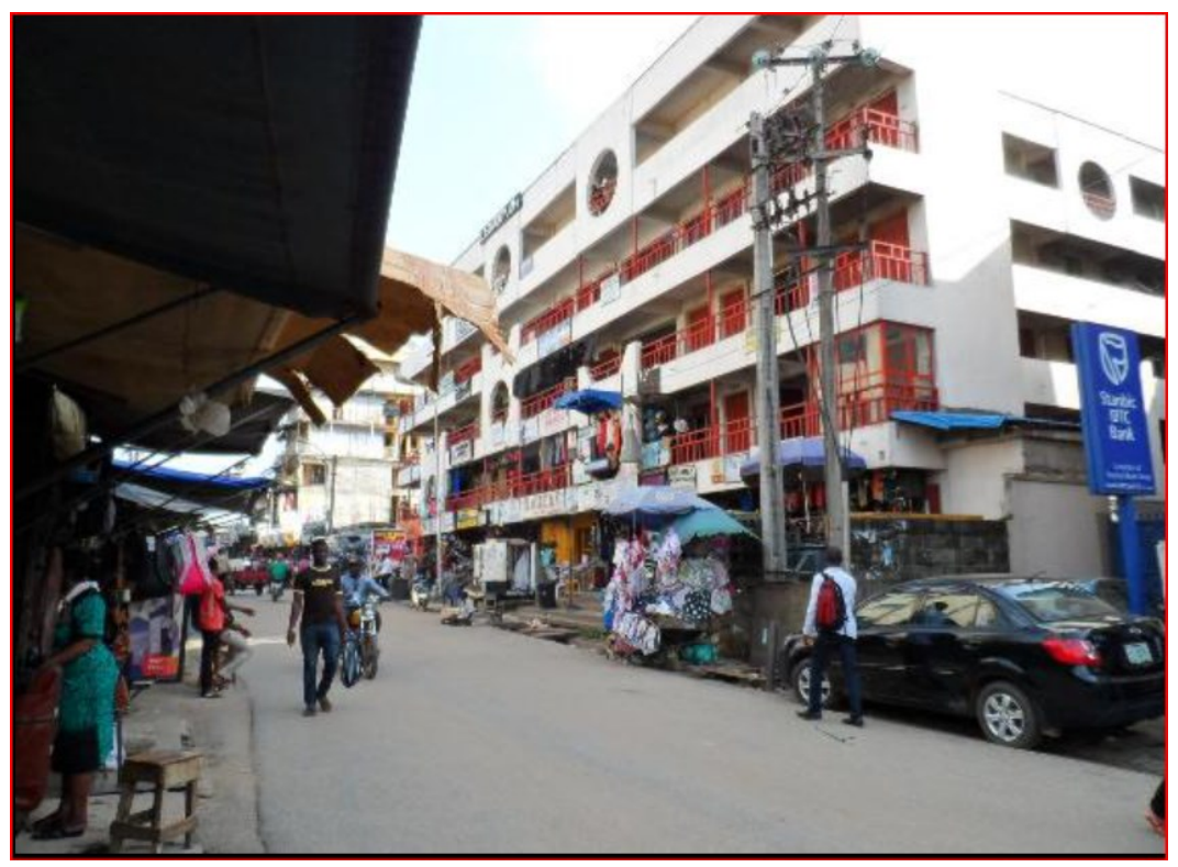
Onitsha (founded: 1550), a Metropolitan City in Anambra State Population (2022 Estimate): Metropolis: 3.6 Mn, Urban: 7.99 Mn, Metro: 8.2 Mn; Area: Metropolis: 830 Km², Urban: 1,965 Km², Metro: 1,965 Km²;

Main Market, the largest market in Africa in terms of geographical size and volume of goods. Onitsha and neighboring Asaba, the capital of Delta State, on the western bank of the Niger River, form a continuous metropolitan area. The Niger River and Niger Bridge defines Onitsha as the gateway to the Igbo heartland.