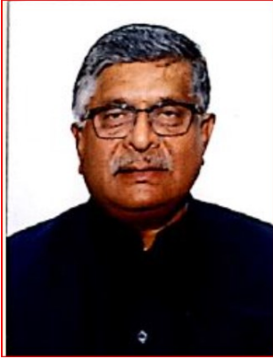
Ravi Shankar Prasad