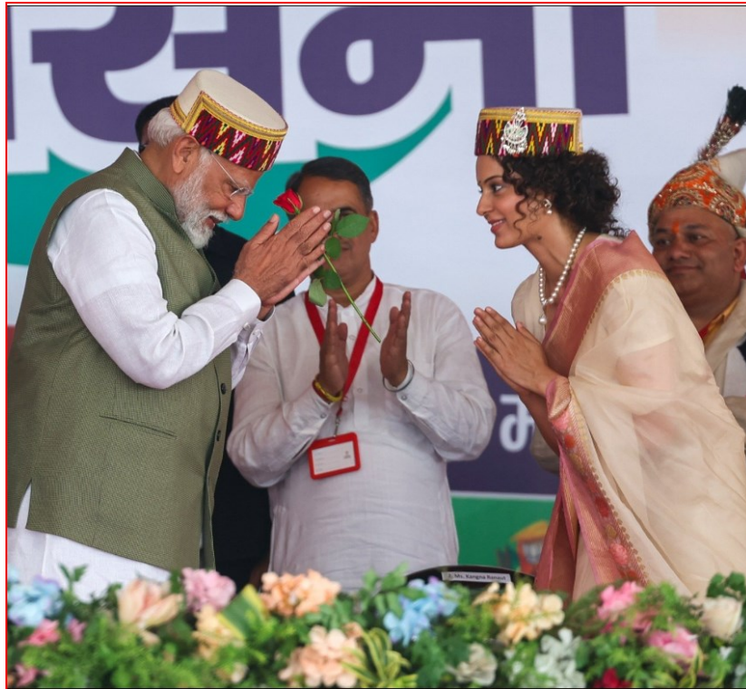
May 24, 2024: Mandi, Himachal Pradesh, India: PM Narendra Modi at an Election Rally for Kangana Ranaut , the BJP candidate

The two main contenders for power are Prime Minister Narendra Modi's governing Bharatiya Janata Party (BJP) and the Indian National Developmental Inclusive (I.N.D.I.) Alliance , a coalition of 26 parties led by the main opposition party, Indian National Congress (INC) , the Grand Old Party, which had ruled over India for 54 years, after independence on August 15, 1947.