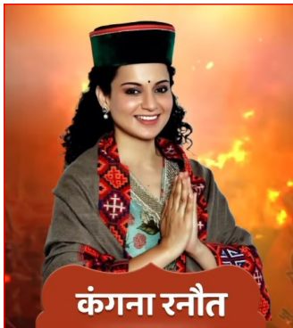
Kangana Ranaut Renowned actress of Hindi movies

6. Mandi, Himachal Pradesh: Kangana Ranaut (BJP); Vikramaditya Singh (INC)