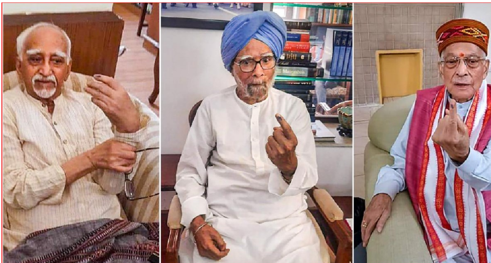
May 17, 2024: New Delhi, India: Postal Ballot being used by Hamid Ansari , former Vice-President; Dr. Manmohan Singh , former Prime Minister, Dr. Murali Manohar Joshi , former Cabinet Minister for Education