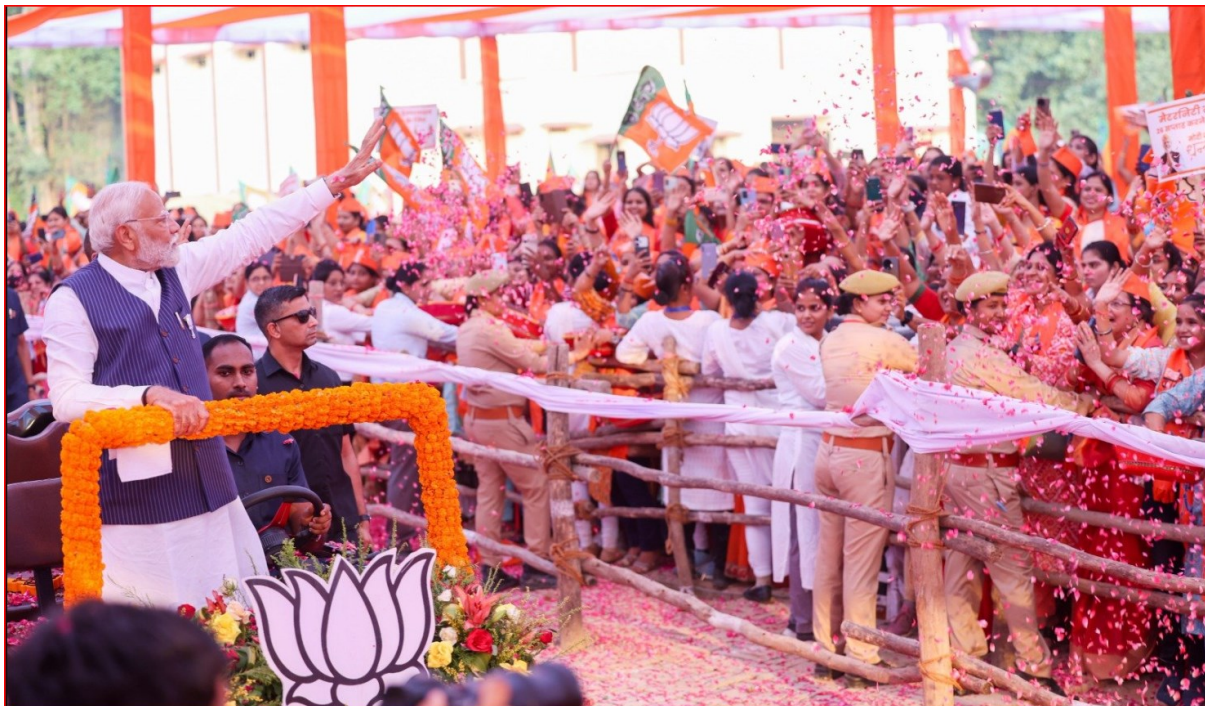
MAY 21, 2024: Women Rally at Baba Vishwanath's city: KASHI , India

Overall, there are 543 parliamentary constituencies across 36 States and Federally-governed Union Territories .