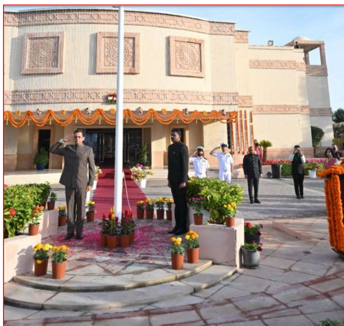
January 26, 2024: Muscat: Ambassador Amit Narang

Sanjeev Sanyal asserted, "India's proficiency in AI, space technology, and drones positions us to actively engage with technological transformations, thereby shaping the evolving global landscape." He predicted, " With a government and policy framework marked by unprecedented agility , India is poised to emerge as a global economic powerhouse , driving inclusive growth and prosperity"