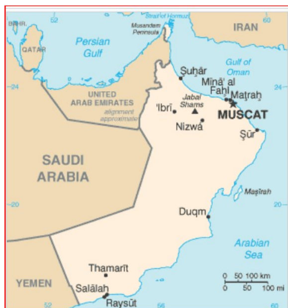
Sultanate of Oman, Capital: Muscat

Population (2021 Estimate): 4.5 Mn (125 th ); Area: 309,500 Km 2 (70 th );