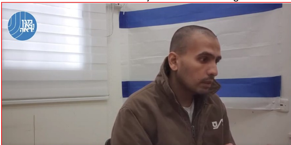
Yahya Sinwar, Leader and Planner of 'October 7 terrorist Attack' on Israel

Benjamin "Bibi" Netanyahu , the Prime Minister of Israel had pledged on October 7, 2023 to catch and punish every single Hamas terrorist. Today, he has agreed to the compromise of accepting a ceasefire if the Hamas leadership is exiled out of Gaza and if Gaza is ruled by a non-radical ruling establishment.