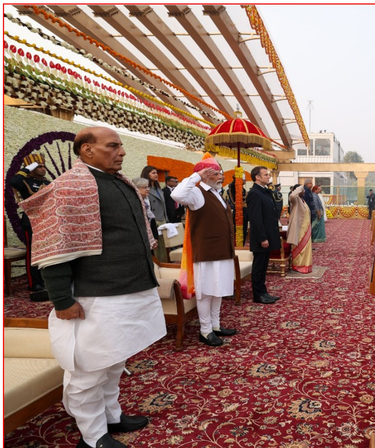
26 January 2024: Delhi: President Emmanuel Macron with PM Narendra Modi

While the Defence Ministers of UK, Germany and Sweden have said, during the last few months, that they were not ready for a war with Russia, they would like Ukraine to continue the war, so that Russia can be weakened.