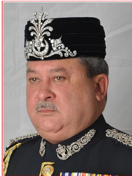
Sultan Ibrahim ibni Almarhum Sultan Iskandar

February 1, 2024: Sultan Ibrahim Iskandar , the billionaire ruler of Johor state, has been sworn in as Malaysia's new king under a unique rotating monarchy system on January 31, 2024 . The 65-year-old monarch is known for his outspokenness and has promised to be a hands-on leader , with a focus on economic revival .