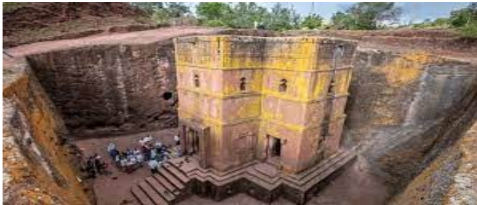
One of the UNESCO world heritage center located in Lalibela

the town's ancient rock-hewn churches, which date back to the 12th and 13th centuries. These churches are important pilgrimage sites for Orthodox Christians.