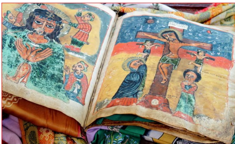
Aksum, Ethiopia: The sacred Book of Miracles in the Church of Our Lady of Zion

Aksum is said to be the home of the Ark of the Covenant, which contains the 10 commandments handed down to Moses by God.