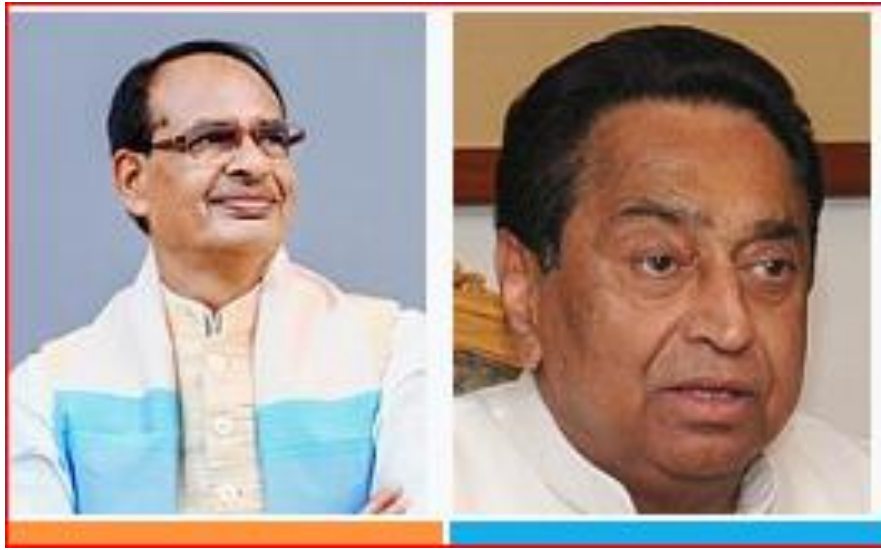
Shivraj Singh Chouhan

December 3, 2023: New Delhi, India: The results of Madhya Pradesh upset all the Election Psephologists, with Bharatiya Janata Party (BJP) winning a land-slide victory over Indian National Congress (INC) .