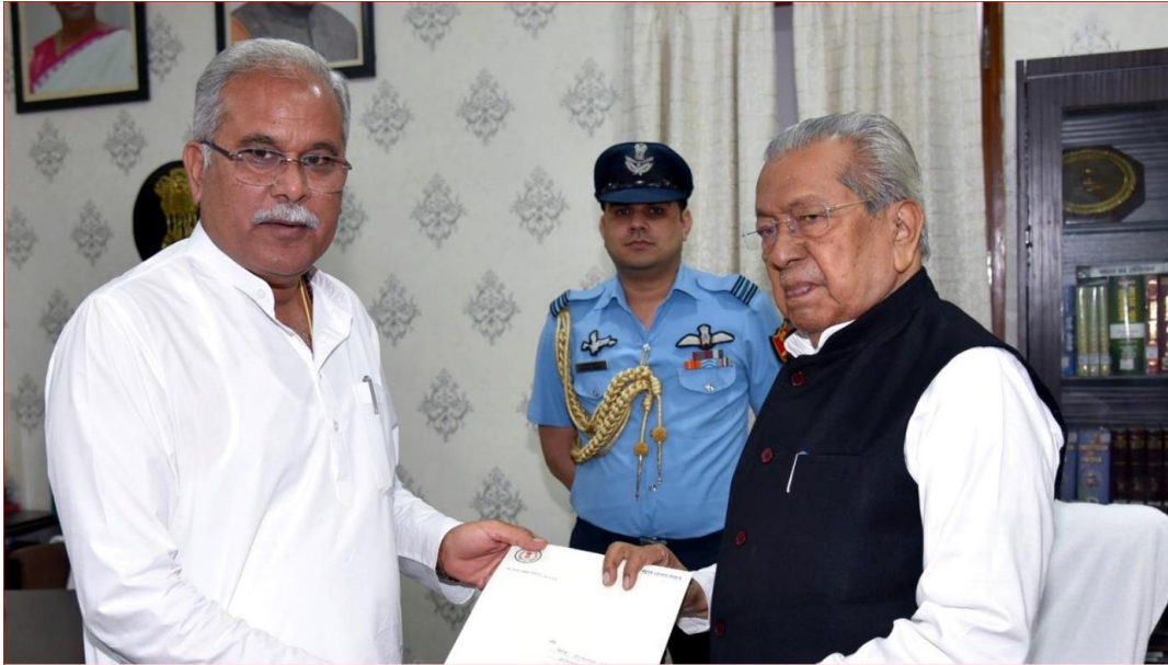
December 3, 2023: Nava Raipur, Chhattisgarh, India: CM Bhupesh Baghel tenders his resignation to Governor Biswabhusan Harichandan at Raj Bhavan

December 3, 2023: New Delhi, India: The results of Chattisgarh stunned all the Election Psephologists, with BJP winning in all the regions of the State, including the tribal belts of Bastar and Sarguja . The tribals and women are supposed to have powered the surprising victory of BJP over INC.