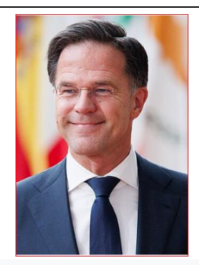
Prime Minister of the Netherlands: Mark Rutte (from: Oct 14, 2010)

On July 7, 2023, a snap election was called after the fourth Rutte cabinet collapsed on July 7, 2023 due to disagreements on immigration policy. The election was held on November 22, 2023. The Party for Freedom (PVV) led by Geert Wilders won the election with the largest number of seats in the House of Representatives . PVV secured 23.6% of the votes and secured 37 seats.