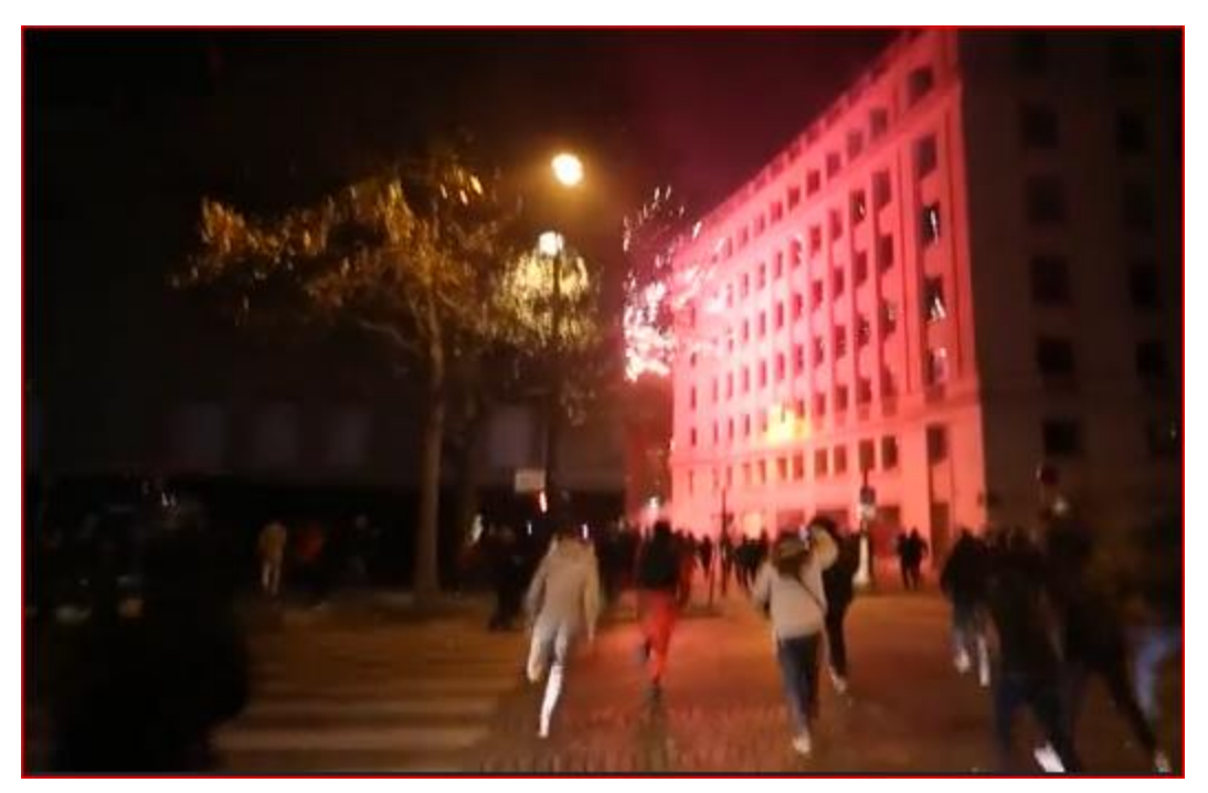
14 December, 2022: Paris, France: Racial Riots

7th Jan 2015: Islamists Attack the Charlie Hebdo Office in France : The attack was carried out by two Islamist terrorists who entered the offices of the French satirical newspaper Charlie Hebdo and opened fire, killing 12 people and injuring 11 others.