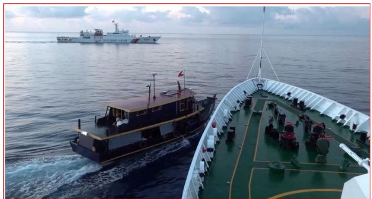
October 22, 2023: South China Sea: A Philippine Boat being BLOCKED by a China Coast Guard vessel

CHINA's AGGESIVE ACTIONS: China's larger neighbours today are either client states like Pakistan and North Korea or it is involved in disputes with them. Each of these disputes can change into a full-scale war in no time. For instance, it has clashed with India in the Himalayas, stepped up patrols around the Japanese-controlled Senkaku/Diaoyu Islands, has had 55 incidents between the Naval vessels of China and Philippines during 2023 and has sent warplanes across the median line in the Taiwan Strait.