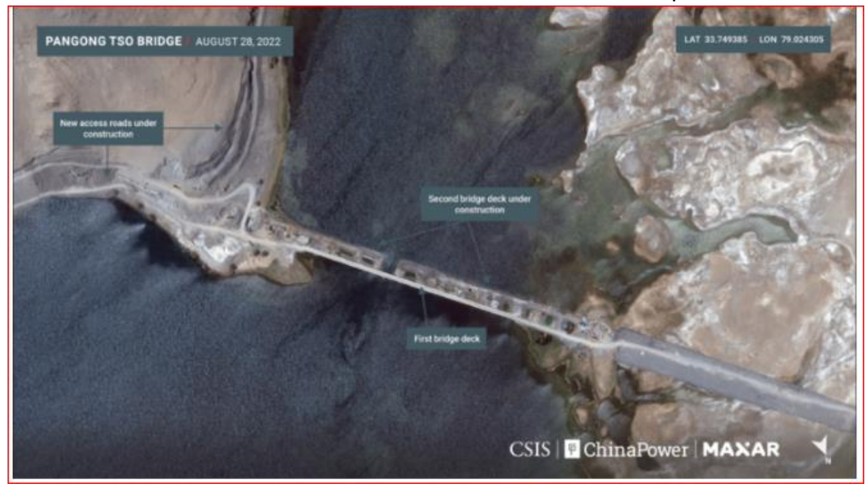
Pangong Yso Bridge

last skirmish between Indian and Chinese armies in the Galwan valley , on June 15 , 2020 , in which India lost 20 soldiers. The incident was one of the deadliest confrontations between the armies of the two nations in the past few decades.