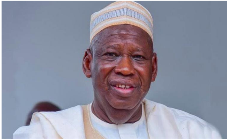
HE Abdullahi Ganduje: elected as APC’s National Chairman on August 3, 2023

appealed to Nigerians “to bear with the President at this trying moment, considering that the country’s economy had been in shambles for years.”