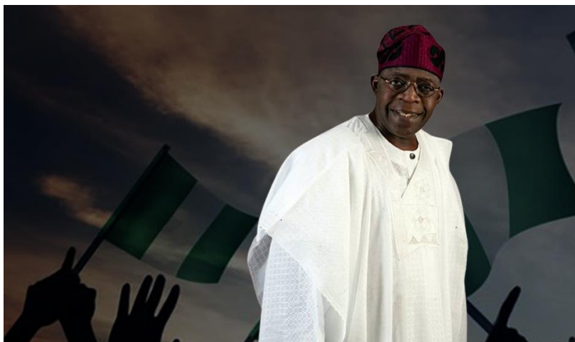
President Bola Ahmed Adekunle Tinubu (GCFR)

proposed cabinet. (Please see Appendix 1 , on pages 6-11, for a brief introduction of each of the 28 eminent persons on the List.)