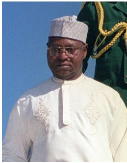
General Abdulsalami Abubakar GCFR

August 3, 2023: Abuja: President Tinubu's Envoys to Niamey and to Libya and Algeria: The delegation, headed by the 11 th Nigerian Head of State, General Abdulsalami Abubakar (Rtd) and with the Sultan of Sokoto, Alhaji Muhammad Sa'ad Abubakar III and the President of the ECOWAS Commission, H.E. Omar Alieu Touray , left for Niamey on Thursday.