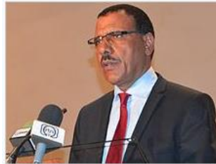
Mohamed Bazoum, who was President of Niger from 2021 until the 2023 coup

ECOWAS had threatened use of force if coup leaders fail to re-instate President Mohammed Bazoum by Sunday, 6 th August . Since the military junta has disregarded the ultimatum, ECOWAS is meeting again on Thursday, 10 th August, 2023.