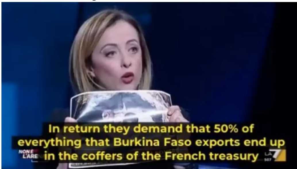
Jan 2019: Fake Information given by Giorgia Meloni , the then MP of 'Brothers of Italy' party: France never "demanded 50% of everything Burkina Faso exports"

Ms. Giorgia Meloni had also mentioned that 50% of reserves of each of these countries were required to be put in the Bank of France so that Bank-to-Bank transactions could be managed for CFA Francs.