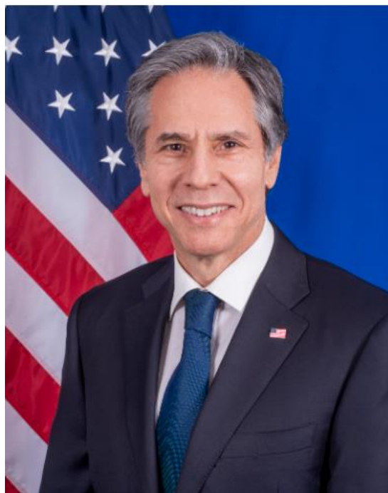
Antony J. Blinken

US Secretary of State Antony Blinken applauded the “key role” being played by ECOWAS in restoring the democracy back in Niger. He called for a non-violent solution to reverse the coup, praising the “determination of ECOWAS to explore all options for the peaceful resolution of the crisis”