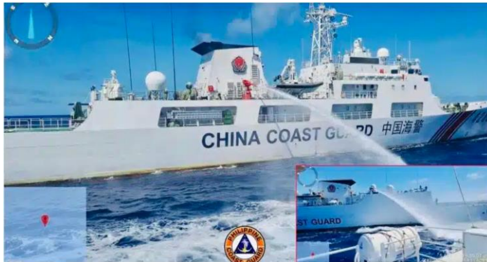
China Coast Guard blocks Philippine Vessel in South China Seas

August 6, 2023: The Philippines on Sunday condemned China Coast Guard latest string of incidents in the disputed waters, the third incident this year where they used water cannons against its vessels heading for a resupply mission of its men in the West Philippine Sea.