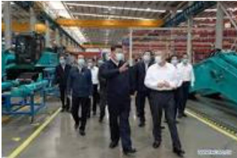
President Xi Jinping stresses INNOVATION during a Factory Visit

www.DiGiNews360.com recognizes the fact that China had been able to universalize its literacy rate and its health infrastructure through barefoot doctors in the decades immediately after 1948, whereas Indian bureaucracy at Delhi had failed in the ‘last-mile delivery’ of the plans on paper, prepared by India’s Planning Commission. But Huileng Tan fails to note that till 1985, India’s GDP per capita was a little more than that of China.