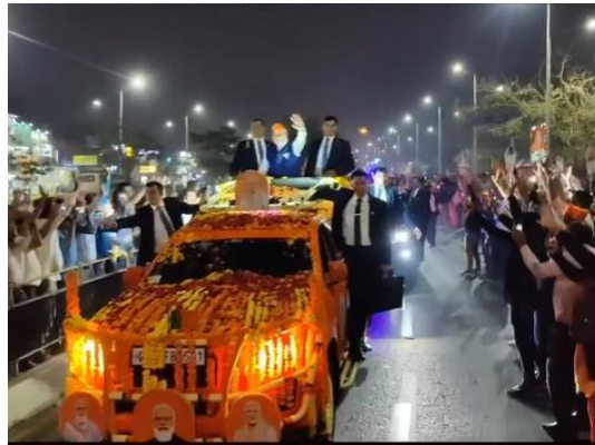
PM Narendra Modi: during an Election Campaign

Zahra also quotes Santanu Sengupta , the Chief India Economist of Goldman Sachs , on capital investment: "Driven by favorable demographics, India's savings rate is likely to increase with falling dependency ratios, rising incomes, and deeper financial sector development, which is likely to make the pool of capital available to drive further investment." Sengupta cites the twin challenges of ‘ increasing the labor force participation ’ and of ‘ simultaneously training and upskilling the labor force ’.