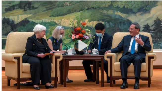
July 8:US Treasury Secretary Janet Yellen with China's Vice-Premier

USA in its desire to stabilize its relations with China has sent Antony J. Blinken, US Secretary of State and Treasury Secretary in high profile visits on July 8 and June 19 respectively. On the other hand, a group of Chinese female economists have been criticized as ‘traitors’, just because they met Janet Yellen over the week-end.