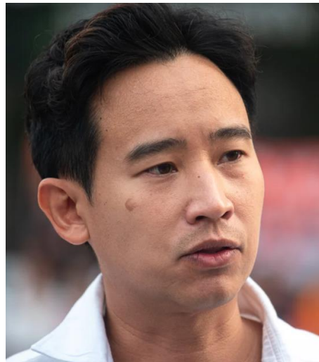
Leader of MOVE FORWARD party: Pita Limjaroenrat

MOVE FORWARD Party: Pita Limjaroenrat , 42, who is likely to be the next Prime Minister, is a Harvard alumni with a background in business. He said that his party plans to amend the country's strict lese majeste laws. In Thailand, no discussion of the royal family is allowed in any media.