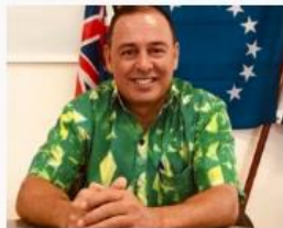
Mark Brown Hon Prime Minister of Cook Islands