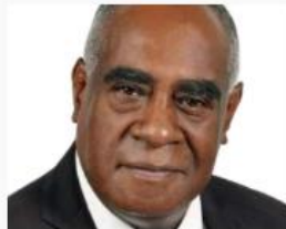
Alatoi Ishmael Kalsakau Hon Prime Minister of Vanuatu