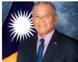
David Kabua H.E. the President of Marshall Islands