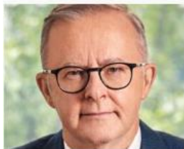
Anthony Albanese Hon Prime Minister of Australia