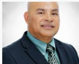
David Panuelo H.E. the President of Federated States of Micronesia