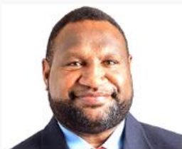
James Marape Hon Prime Minister of Papua New Guinea