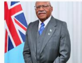
Sitiveni Ligamamada Rabuka Hon Prime Minister of Fiji