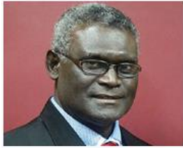
Manasseh Damukana Sogavare