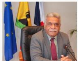
Louis Mapou H.E. the President of New Caledonia