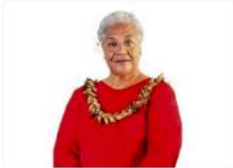
Fiamē Naomi Mata'afa