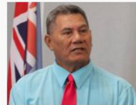
Kausea Natano Hon Prime Minister of Tuvalu