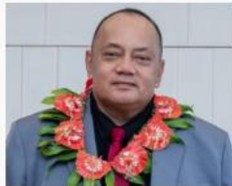
Hu'akavemeiliku Siaosi Sovaleni