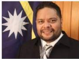
Russ Joseph Kun H.E. the President of Nauru