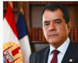
Édouard Fritch H.E. the President of French Polynesia