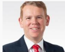
Chris Hipkins Hon Prime Minister of New Zealand