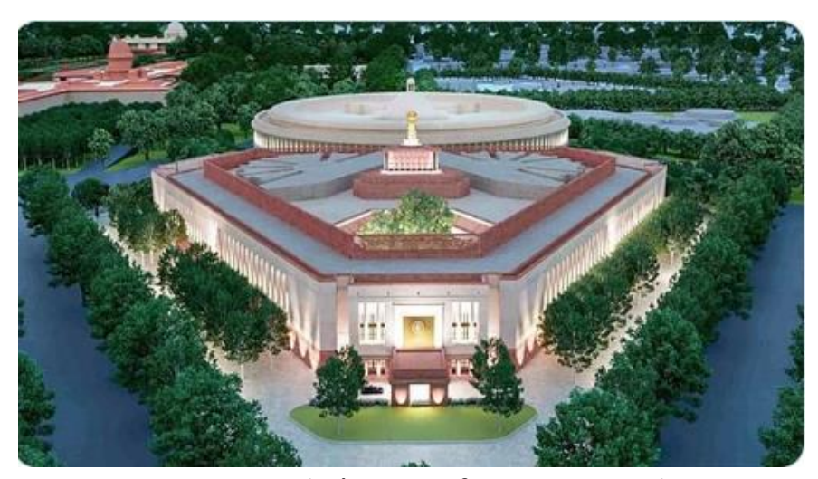
May 28, 2023: India's Magnificent New Parliament

May 28, 2023: New Delhi: Prime Minister Narendra Modi inaugurated the magnificent new Parliament, in which Indians can take pride.