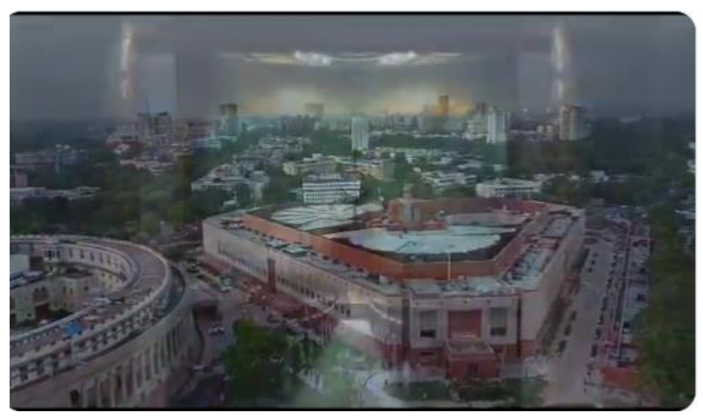
28 May 2023: New Parliament building (right) and Old Parliament building (left)

We have pictures to show how the Sengol was handed over... The pictures are enough for evidence."