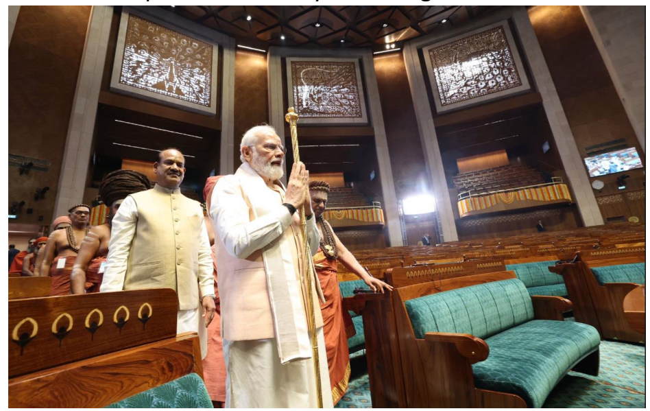
May 28, 2023: Prime Minister: holding the sacred SENGOL before Installation near the Speaker's Chair

civilization being revived and given its rightful place by the highest political dispensation in the temple of democracy is nothing but a dream come true."