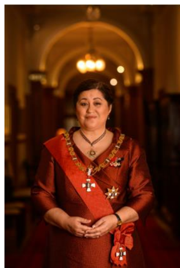
H.E. Dame Alcyion Cynthia Kiro