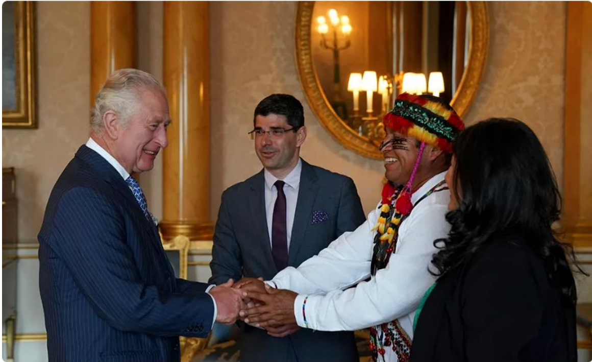
Amazonian Indigenous Leaders Greet King Charles III

Members of Foreign Royal Families, Heads of State and Representatives from the Commonwealth were received and welcomed to the United Kingdom on behalf of The King.