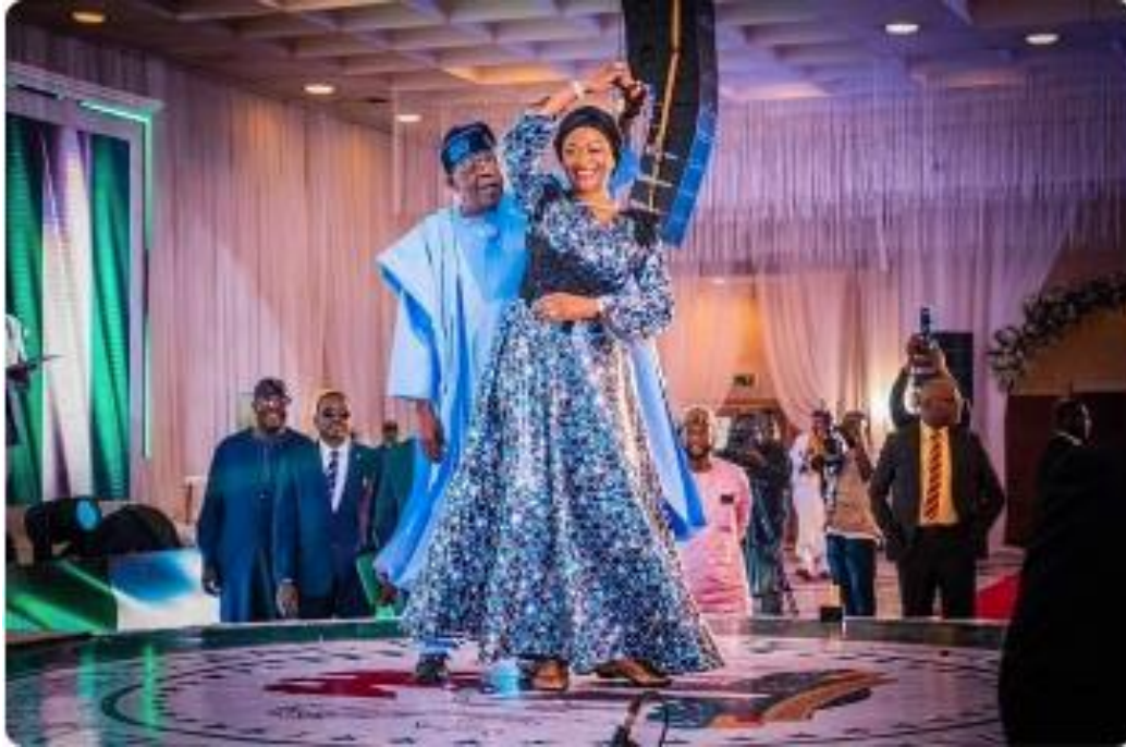
May 29, 2023: Abuja: Asiwaju Bola Tinubu is the 16 th President of the Federal Republic of Nigeria. Senator Remi Tinubu , wife of the President, Major General Muhammadu Buhari and Mrs. Aisha Buhari are also seen in the photograph.