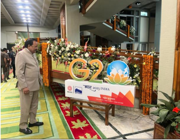
Art and Craft Bazaar and Exhibition Stalls at SKICC