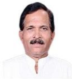
Shri Shripad Yesso Naik Minister of State for Tourism