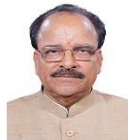
Shri Ajay Bhatt Minister of State for Tourism