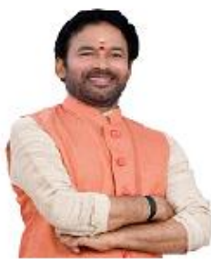
Shri G. Kishan Reddy Minister of Tourism

The city of Srinagar, J&K, India has taken precautionary measures against terrorist attacks, orchestrated by Pakistan's ISI. During the three days, the Foreign Minister of Pakistan will remain in the areas of J&K, occupied by Pakistan after the attack of October 1947. Is this visit to motivate the terrorists, so that at least some attacks may succeed in causing some damage in India? The Ministers of Government of India, responsible for making the G 20 Tourism Working Group meeting a success, are as follows: