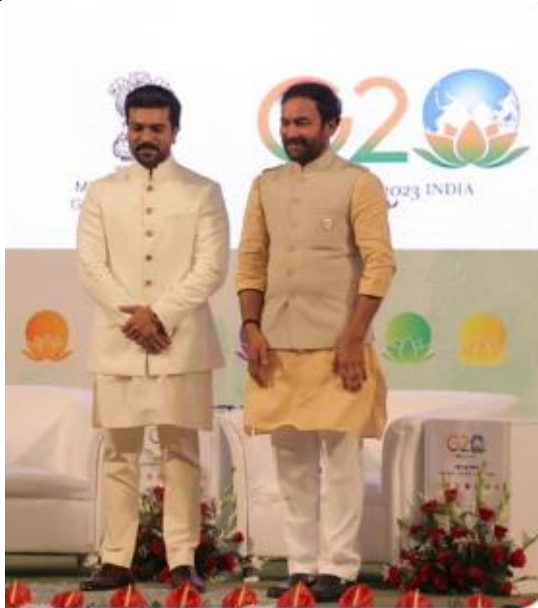
Superstar Ramcharan Tej and G. Kishan Reddy, Union Tourism Minister

At the inaugural program for the 3 rd meeting of the G 20 Tourism Working Group Meeting, at the Sher-i-Kashmir International Conference Center, Srinagar, G. Kishan Reddy, the Union Tourism Minister honoured the Superstar Ramcharan Tej, who showed the steps of his NATO dance, which won an Oscar Award in 2023.