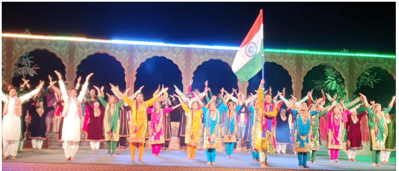
22 May Eve: Cultural Program at SKICC: Vibrant Heritage by Artists of Kashmir

He also said that a draft ' National Strategy on Film Tourism ' will be unveiled to provide a roadmap for harnessing the role of films in promoting tourist destinations.