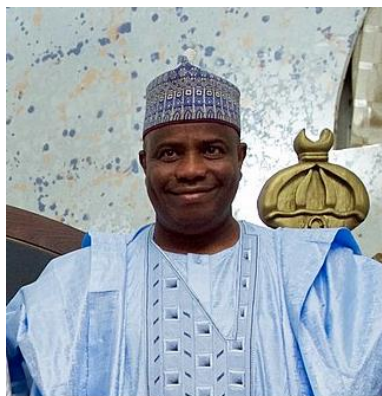
Rt Hon. Aminu Tambuwal, Governor of Sokoto State

The governors vowed to resist any such move and reiterated their commitment to Nigeria's democracy as elected leaders.