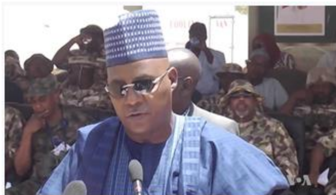
Vice-President Elect: Kashim Shettima Mustapha

Senator for Borno Central since 2019 and Governor of Borno State(2011 to 2019) While speaking at the Book-Reading, he added,” “We need to read to know what is happening in the world.”