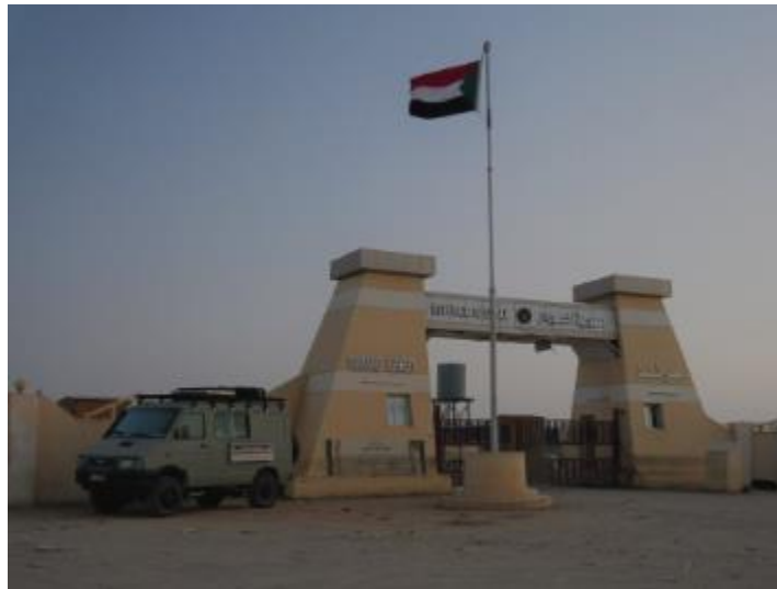
Egypt-Sudan Qustal/Eshkeet border crossing

FG has allocated $1.2 million to rent buses for evacuating Nigerian students from Sudan. The First batch of 637 in 13 buses have arrived from Khartoum at the Egyptian borders. Nine buses have arrived at the Sudanese side of the Arkin border, and four buses have also arrived at the Wadi Halfa border (approved by Egypt for Nigerian students). Arkin is 200 Km from Wadi Halfa. The Nigerian Air Force and Air Peace Airlines will bring them from Egypt to Nigeria. 29 buses are expected to be in the second batch. Sources in the Federal Government said that a very large number of other Nigerians were also present in Sudan and most of them also wanted to leave Sudan. Hence the arrangements may prove to be inadequate.