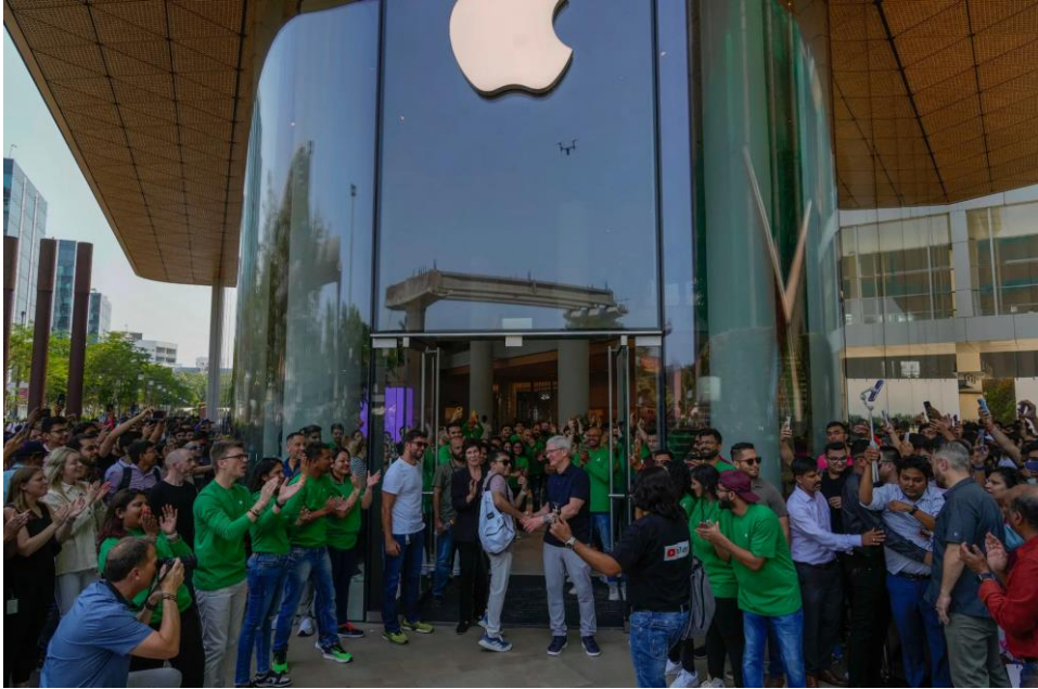
Opening of Apple's first outlet in India: Tim Cook, CEO Apple welcomes a visitor

On Thursday, Mr. Cook will travel to New Delhi to open a second store, Apple Saket, at the centre of the capital's biggest mall.