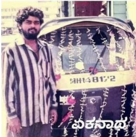
Eknath Shinde: A Rickshaw