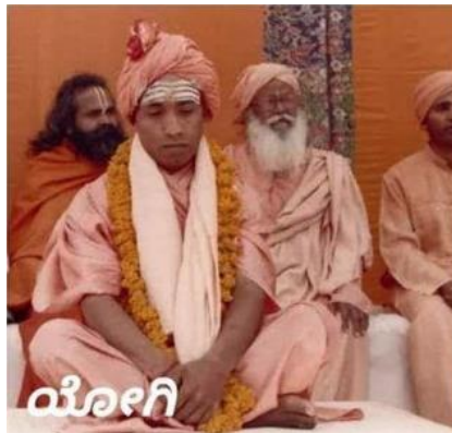
Adityanath: A Yogi*