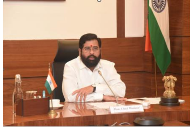
Eknath Shinde, Chief Minister, Maharashtra, the richest State of India