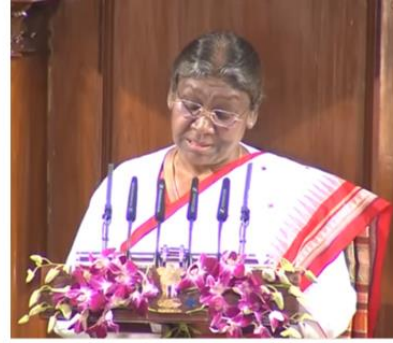
31 Jan 2023: Smt Draupadi Murmu , President of India, addressing the Parliament of India