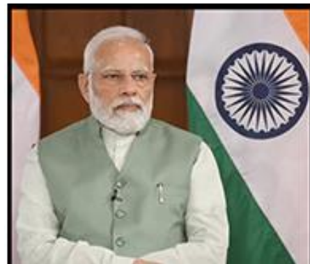
Narendra Modi: Prime Minister of India