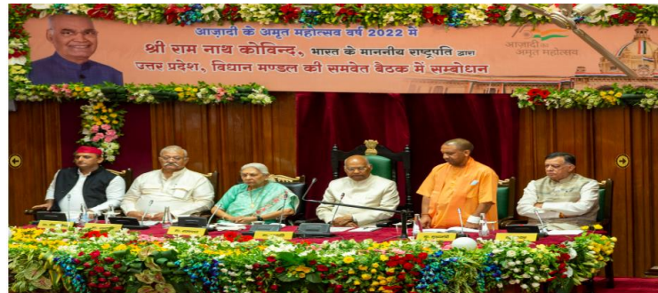
Yogi Adityanath: Chief Minister of UP, the largest State: Speaking at the Joint Session

Reference: For Eknath Shinde: https://www.instagram.com/mieknathshinde/?hl=en