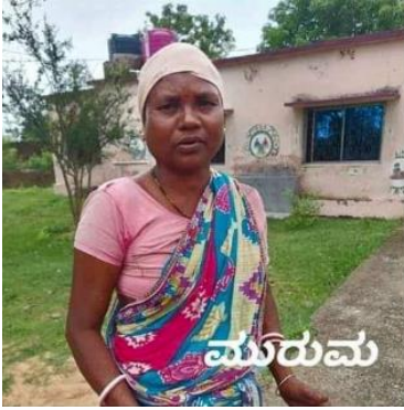
Smt. Draupadi Murmu: in her small home in a poor village