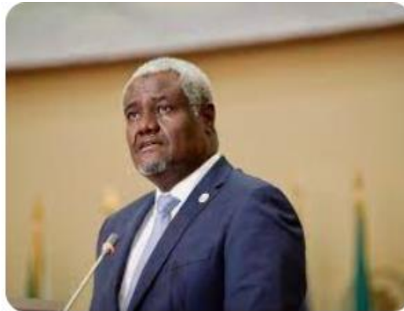
Chairperson, African Union: H.E. Moussa Faki Mahamat

The statement from the Chairman’s office said,” the Chairperson urges all stakeholders to uphold peace and the rule of law, and further urges that any post-election dispute or grievance be pursued through the judicial system, as provided for by the law.