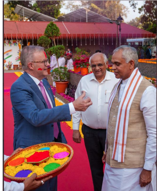
Australian Prime Minister with Gujarat’s Governor and Chief

March 8, 2023: “Holi Hai,” says Prime Minister Justin Trudeau : Trudeau’s statement: