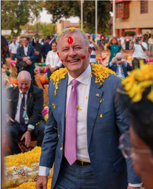
Celebrating Festival of Colours at Governor House at Gandhinagar

March 8, 2023: Prime Minister Anthony Albanese celebrating HOLI at Ahmedabad : “Holi’s message of RENEWAL through the triumph of good over evil is an enduring reminder for all of us,” said Albanese.