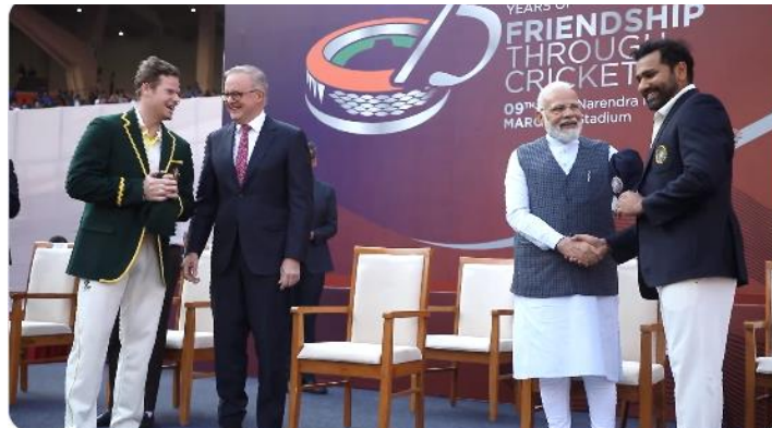
March 9, 2023: Australian and Indian PMs with the two Captains at the Ahmedabad Cricket Stadium, the largest Cricket Stadium of the World

March 9, 2023: 75 years of Cricketing Relationship with Australia: In November 1947, the Cricket Team, under the banner of free India, had the first series of test matches in Australia. Australian Prime Minister and Narendra Modi watched the 4 th Test match between the Australian Cricket team and the Indian Cricket Team.