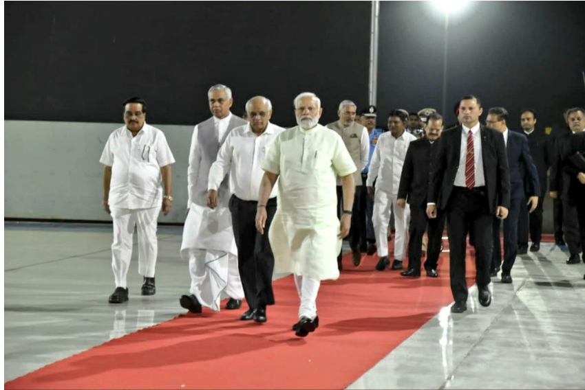
March 8, 2023: Narendra Modi arrives at Ahmedabad from the North-East

In the morning he is to be at 10 AM at the Narendrabhai Cricket Stadium located in the Sardar Patel Sports Complex, being built to standards so that in future, it may be able to host Olympic games. Australia's Prime Minister.