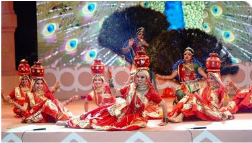
Wed Evening: Welcoming Guests to #G20FMM with a performance centered on the festival of Holi

On Wednesday evening, a cultural program, centered on the forthcoming Holi Festival was presented for the delegates.