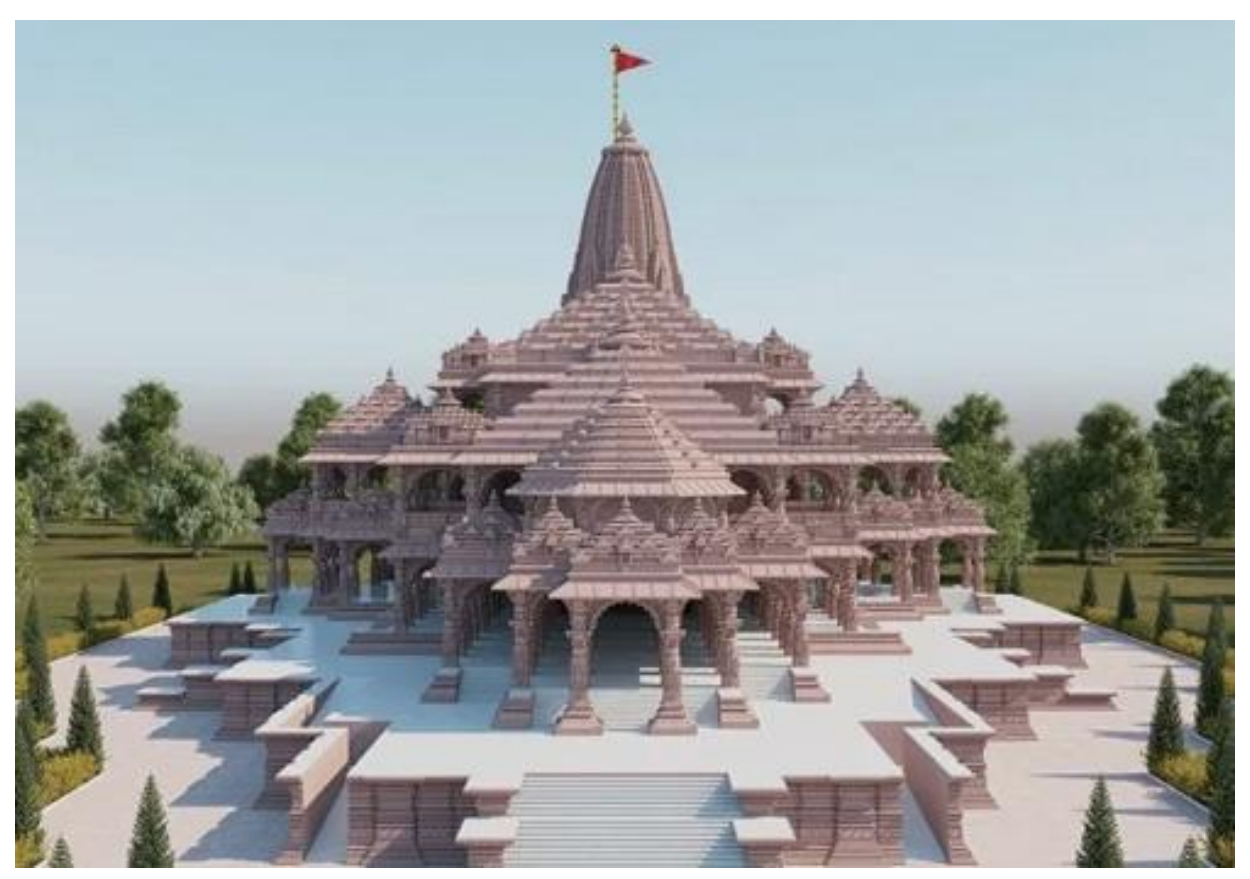
Ram Janambhoomi Temple at Ayodhya: to be completed by 2024 ( Ref : Website of Shri Rama JanmaBhoomi Teerth Kshetra: <a href="https://srjbtkshetra.org/">https://srjbtkshetra.org/</a>)