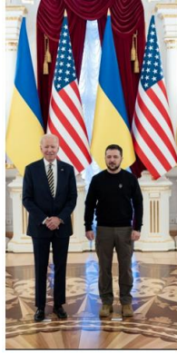
Biden & Zelenskyy