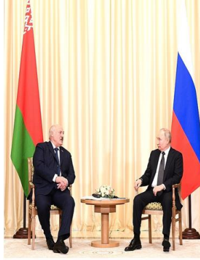
Putin & Lukashenko