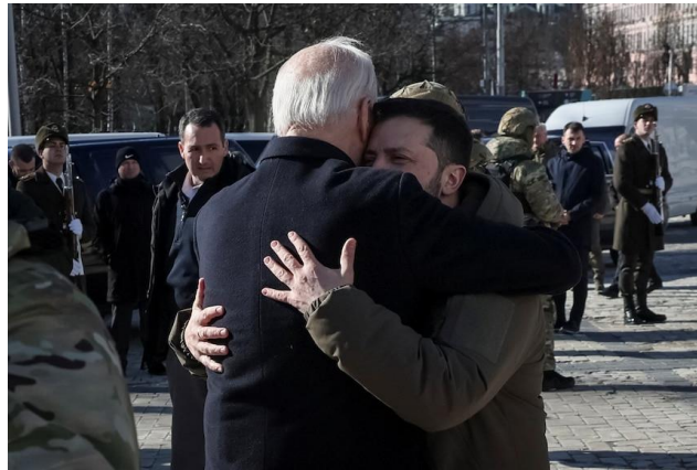
Biden & Zelenskyy, near the Wall of Remembrance

20 th February 2023: President Joe Biden visited Ukraine, by using a train from Poland to Kyiv. The visit was supposed to be secret, but was known to Russia, say Russian sources.