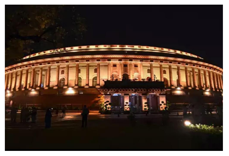
India's Parliament Building: A New Building is fast coming up

Such Awards recognize excellent parliamentarians and help raise the working of Parliamentary institutions to higher levels.