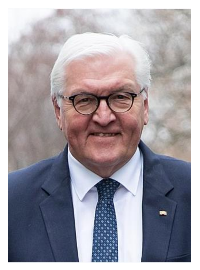
President of Germany: Frank-Walter Steinmeier

( Note: Prime Minister Narendra Modi has been consistently for peace in Ukraine at the earliest.)