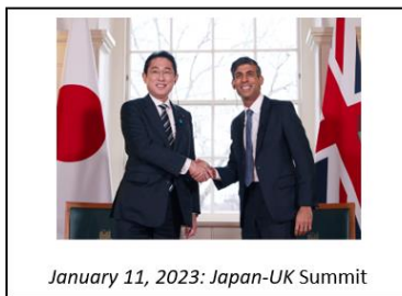
January 11, 2023: Japan-UK Summit