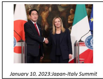
January 10, 2023: Japan-Italy Summit

In December 2022, Japan had also decided to buy U.S.-made Tomahawks and other long-range cruise missiles that can hit targets in China or North Korea .