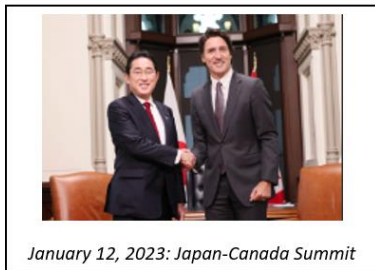
January 12, 2023: Japan-Canada Summit

Before coming to Washington DC, the Japanese Prime minister had signed an agreement, with Britain's Prime Minister Rishi Sunak, for joint military exercises of UK and Japan. Kishida also discussed security co-operation with Canadian Prime Minister Justin Trudeau, Italian Prime Minister Giorgia Meloni and French President Emmanuel Macron.