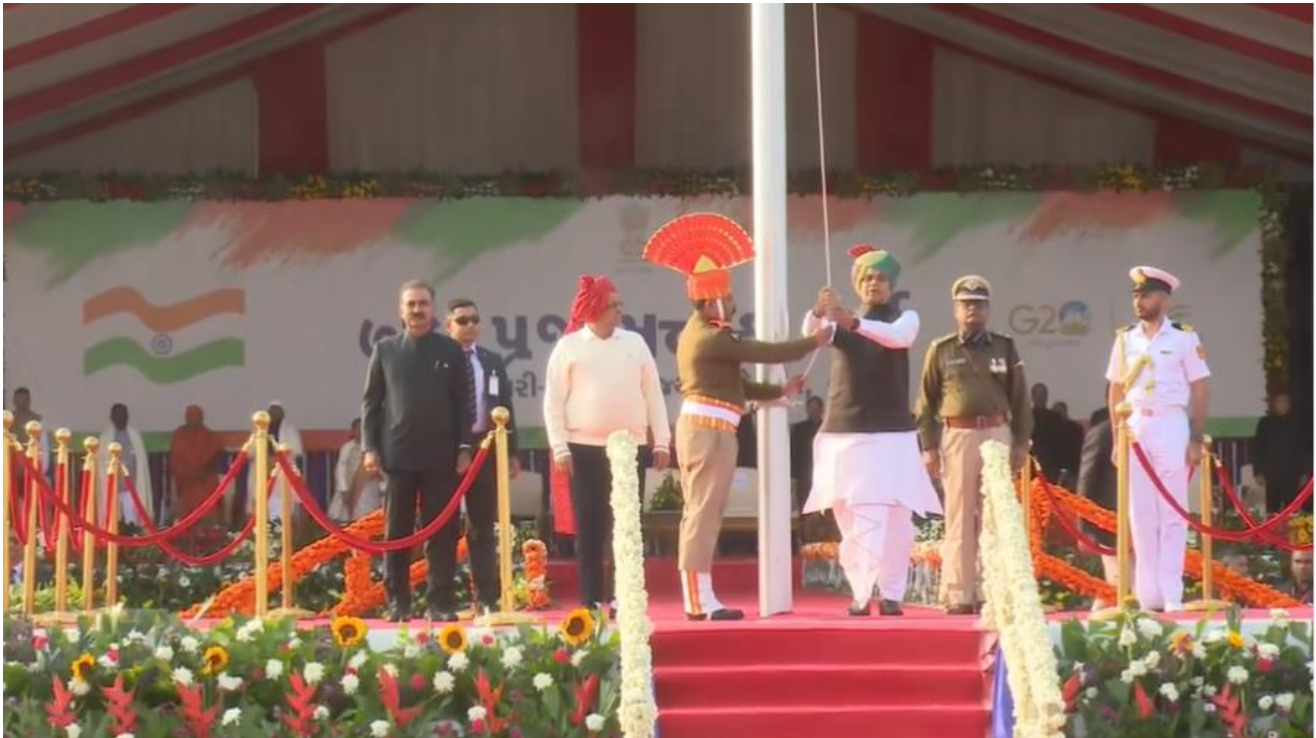
Flag Hoisting at Botad