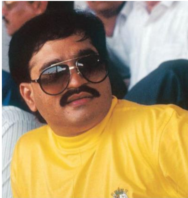
Dawood Ibrahim: the most wanted terrorists in India